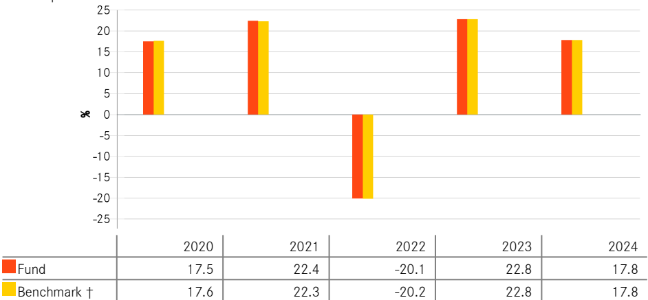
Historic performance to 31 December 2024

† Benchmark: MSCI World ESG Enhanced Focus CTB Index (USD)